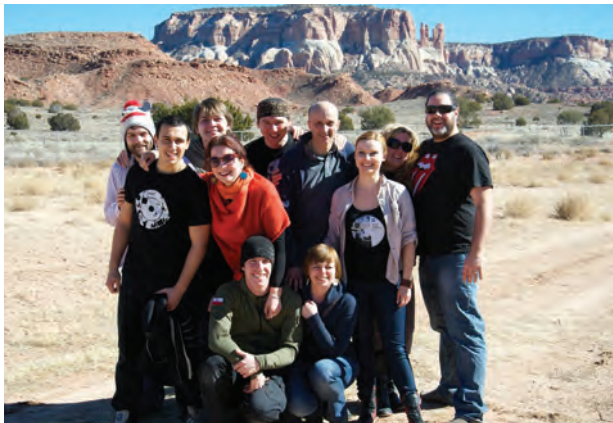
Tricklock Company of Albuquerque, New Mexico, and Teatr Figur from Krakow, Poland, touring Artistic Handicraft at Zuni Pueblo in February 2013.