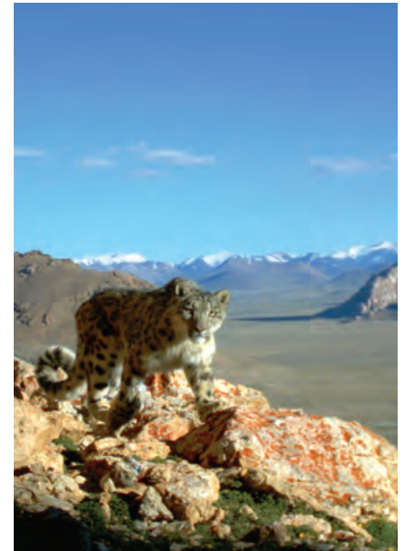
A picture of a snow leopard taken in the Pamir Mountains of Tajikistan as part of a conservation project initiated by Panthera in summer 2012.